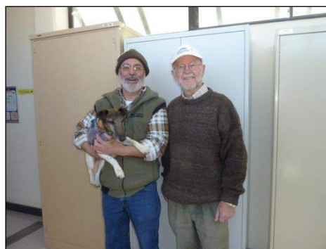
Right: After 2 frustrating hours we had the cupboard completed and a job well done.