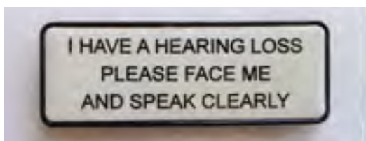
New badge for hearing impaired bhacanberra@gmail.com