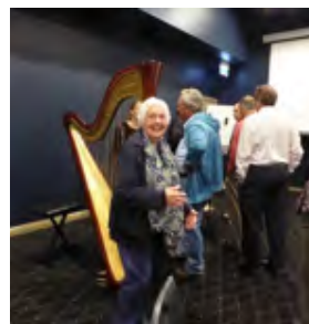
Rediscovering Music Day